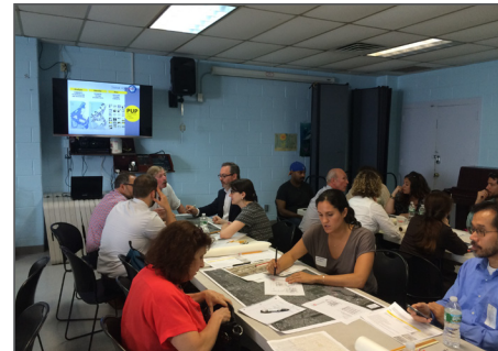
PUP Session, Sheepshead Bay, NY

After a disaster strikes, communities are in need of more housing options, yet many of the options provided do not fit into an urban, built environment. Post-disaster recovery hinges on effective collaboration between governmental and non-governmental entities, and the utilization of all available community resources to find solutions for displaced residents. The goal of the Participatory Urban Planning (PUP) Toolkit is to develop and implement a participatory-based model that facilitates housing recovery for as many people as possible in the shortest amount of time. The Toolkit will provide jurisdictions with a customizable template to ensure community resilience to disaster through coordinated response and recovery, specifically by addressing the need for post-disaster housing.